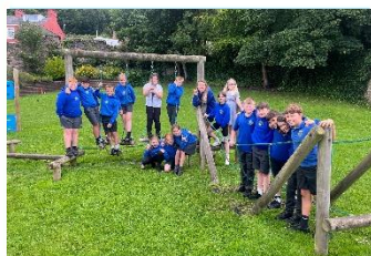
Move Up Day

We have had a great week of learning and activities this week. Check out Class Dojo for lots of updates and photos.