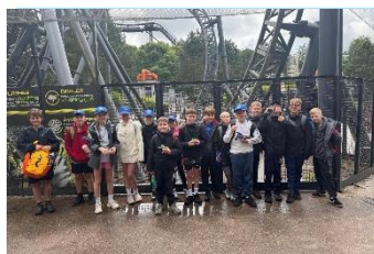
Year 6 residential

We have had a great week of learning and activities this week. Check out Class Dojo for lots of updates and photos.