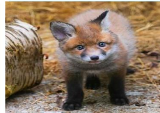
School Ambassadors helping Knowwood Wildlife