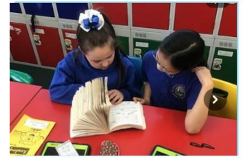
Reading Together !