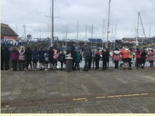
Class 6 visiting the Sea Bin

Here are links to some activities which have been happening in school this week (click on pictures) -