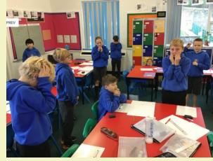
Year 5 Drama for writing