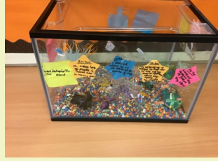
Class 5's Plastic Pollution homework