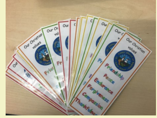
Class 4 thinking about Christian values

Check out some of the other galleries showing the children learning and exploring a range of different topics. Check out your child's class page here.