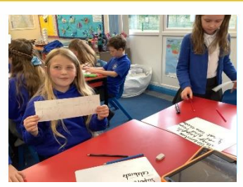
Bassenthwaite Class Worship