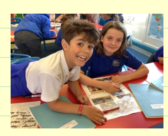
Bassenthwaite - Geography-Settlements

Check out all of the other galleries showing the children learning and exploring a range of different topics. Check out your child's class page here.