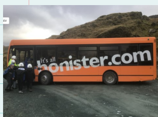
Honister Slate Mine

Here are links to some activities which have been happening in school this week (click on pictures) -