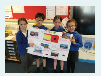
Year 5 Rembrant Workshop