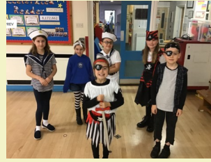
Class 3 at The Rum Story