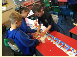
Class 6 creating protest banners