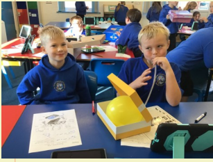
Class 4 creating Pneumatic

Here are links to some activities which have been happening in school this week (click on pictures) -