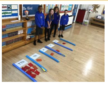
Year 6 Maths