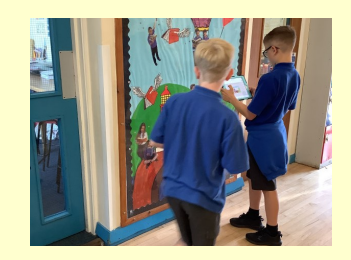
Windermere— Who built the pyramids?

Check out all of the other galleries showing the children learning and exploring a range of different topics. Check out your child's class page here.