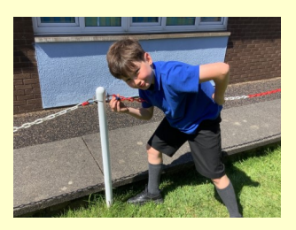
Buttermere—Finding magnetic materials